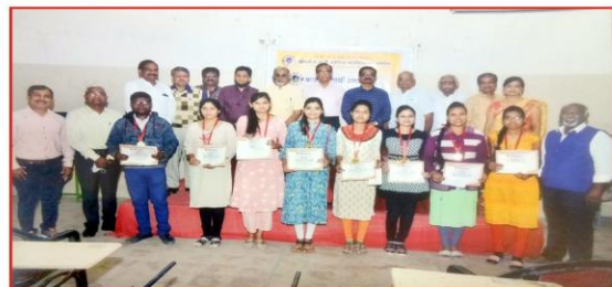
Prize Distribution Ceremony under the auspicious of Alumni Association