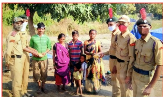
Diwali Snacks distribution by NCC Cadet of Smt. LRT College of Commerce Akola, in Slum Areas