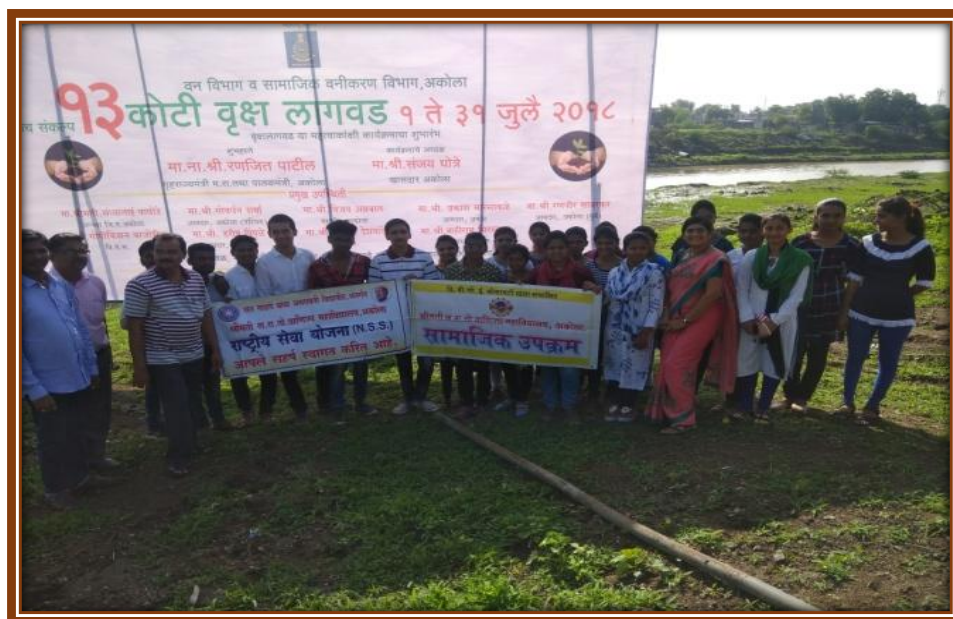
NSS Volunteers Participated in '13 Crore Tree Plantation Project' Under "VANMOHOTSAV – 2018"