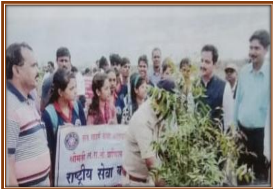
NSS Unit in Presence of Guardian Minister of Akola District Hon. Dr. Ranjeet Patil Planting Trees under '13 Crore Tree Plantation Project' Under "VANMOHOTSAV – 2018"