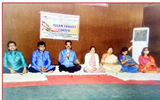
Intercollegiate Sugam Sangeet Contest Feb 2021