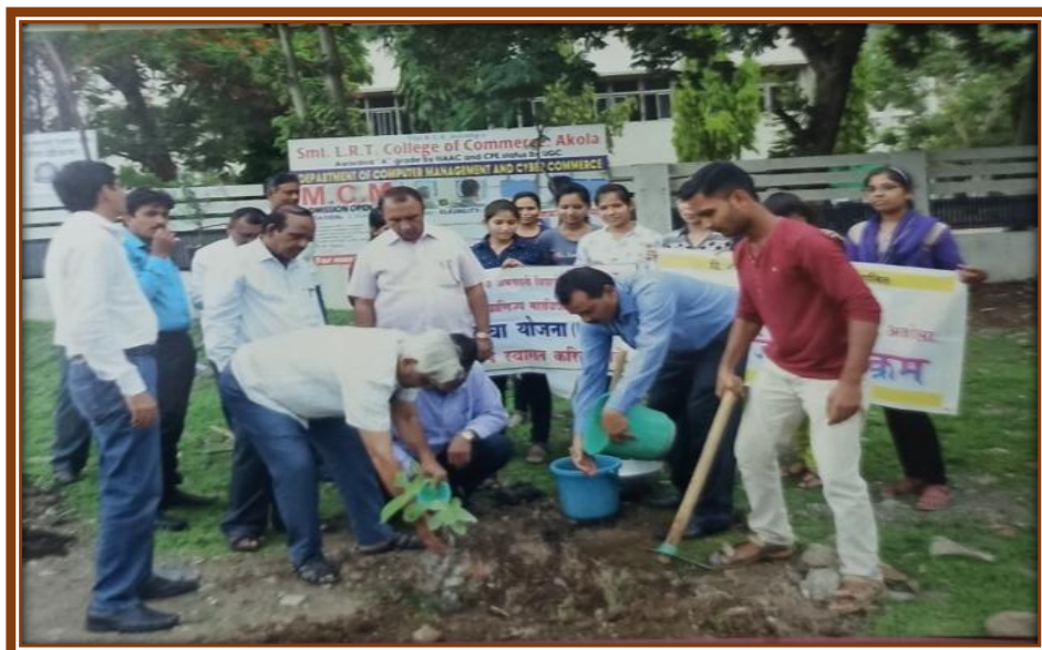
NSS Unit doing Tree Plantation under Environment Protection Campaign