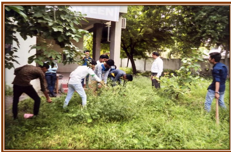
NSS Volunteers Removing Grass under “Swaccha Bharat Abhiyan”