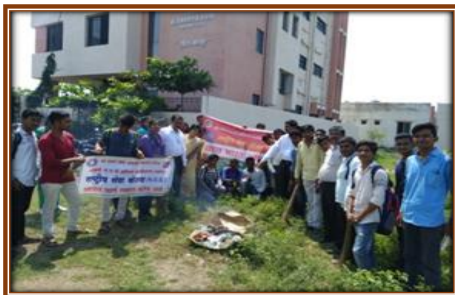
Celebrated NSS Foundation Day by Conducting Cleanliness Drive at 'SURYODAY BAL GRUHA', Malkapur, AKOLA