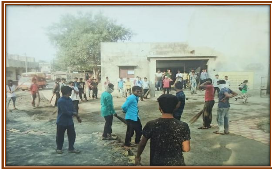
Cleanliness Drive under Swaccha Bharat Abhiyan in NSS Special Camp at Adopted Village Kumbhari