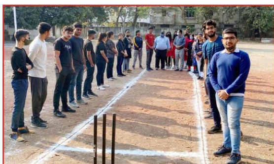
Cricket Match organized by C.O.C Department