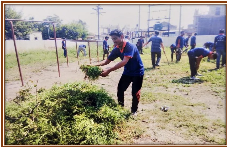
NSS Volunteers Conducting Cleanliness Drive at Adopted Village Khirpuri