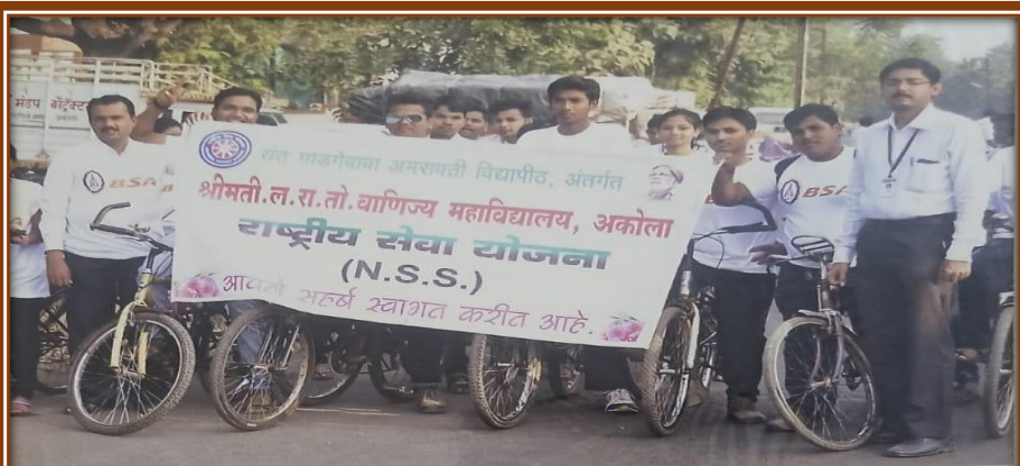
NSS Volunteers participated in Cyclone Rally.