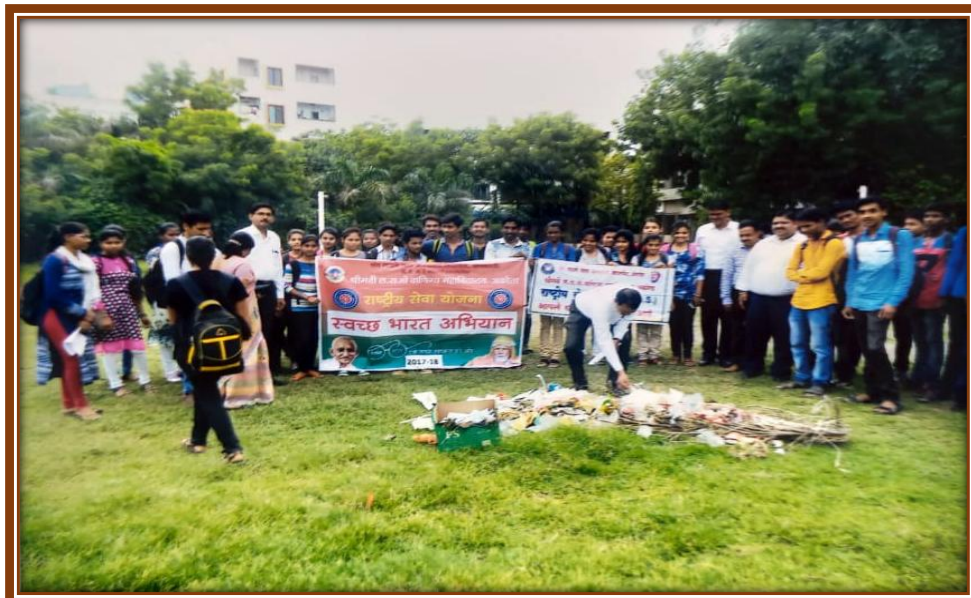
NSS Unit Celebrating Mahatma Gandhi Jayanti by Conducting Cleanliness Drive in College Premises