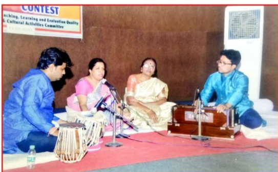
Intercollegiate Sugam Sangeet Contest Feb 2021