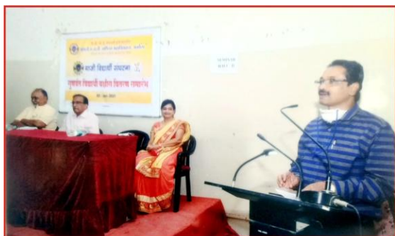
Alumni Association Prize distribution Ceremony 2019-2020