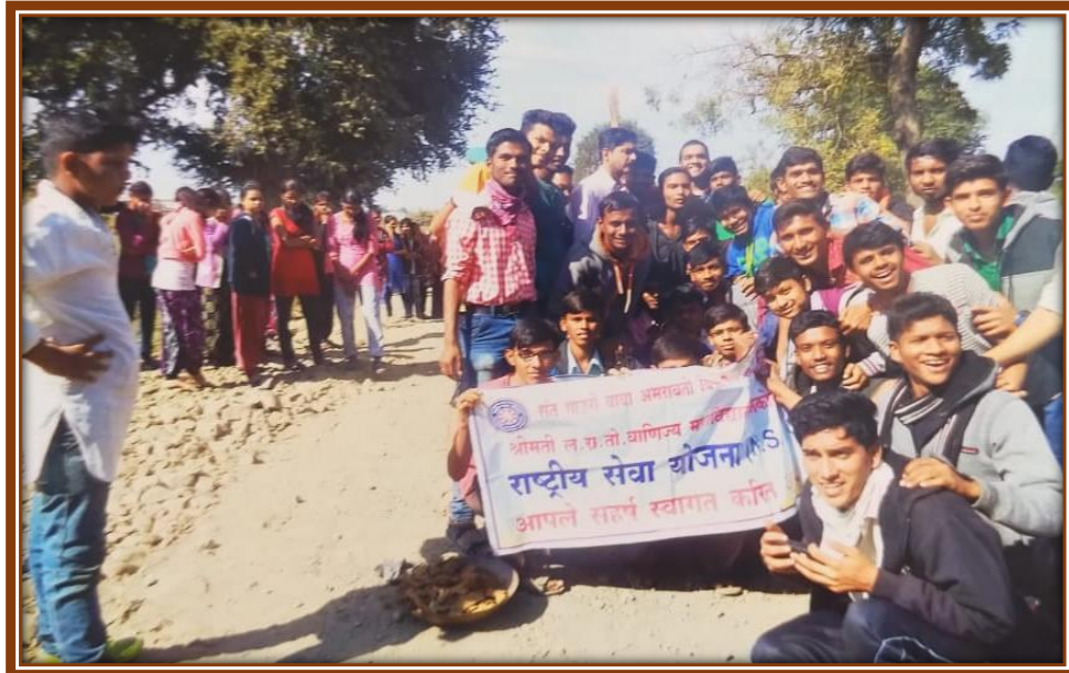
NSS Volunteers Collecting Stone Material for Filling Soak Pits (Waste Water Management) at Adopted Village Kumbhari