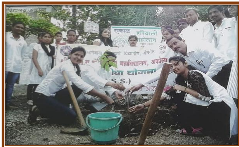
Celebrating Independence Day by Tree Plantation at College Premises