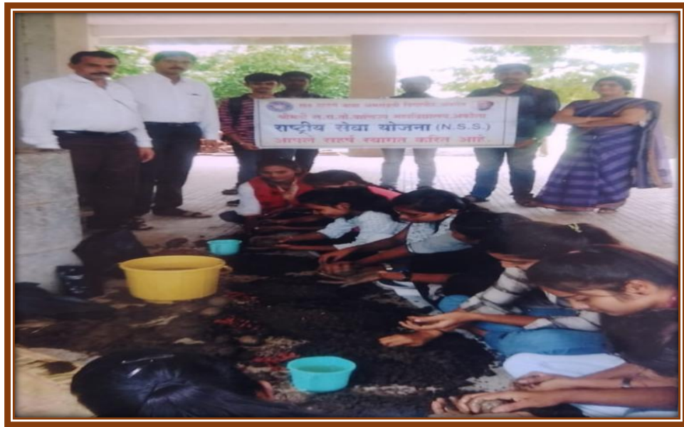
NSS Volunteers Making 'SEED BALLS' For Plantation