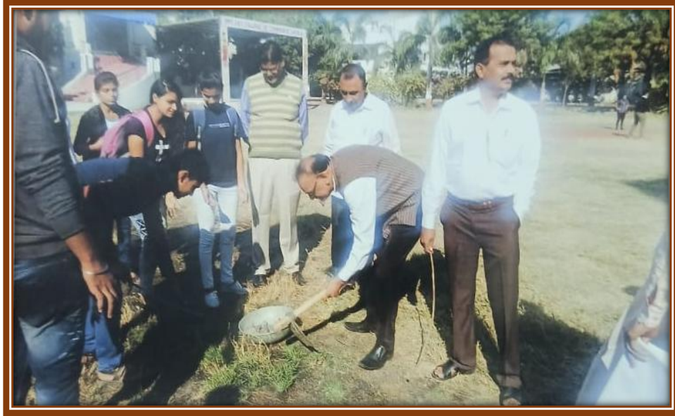
Cleanliness Drive under Swaccha Bharat Abhiyan