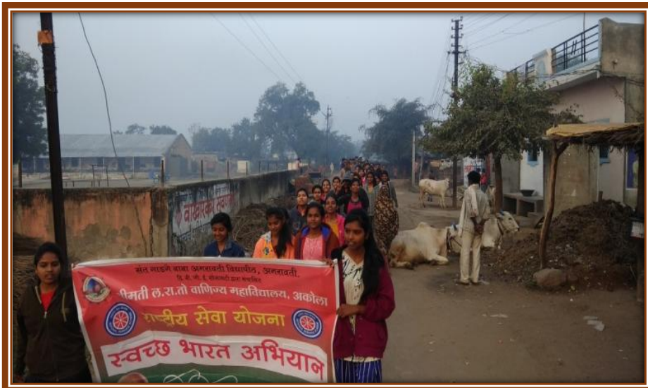
NSS Unit Organised 'SWACCHATA AWARENESS RALLY' Under "SWACCHA BAHARAT ABHIYAN"