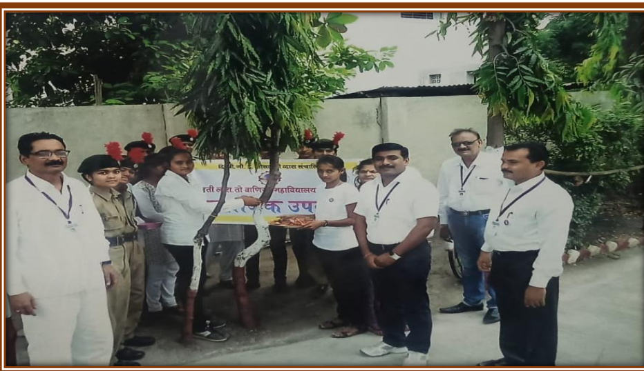
NSS Volunteers Tying Rakhis to the Trees at Rakshabandhan