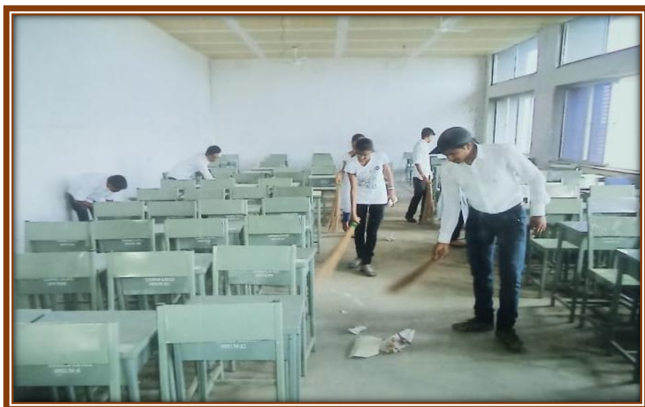
NSS Volunteers Cleaning Classrooms and College Premises under “Swaccha Bharat Abhiyan”