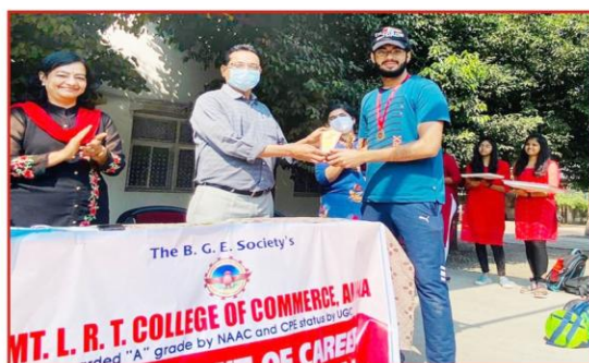
Prize Distribution of Cricket Match