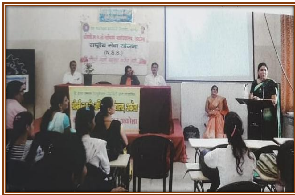
'CLEAN AKOLA – GREEN AKOLA' Workshop Organized By NSS Unit