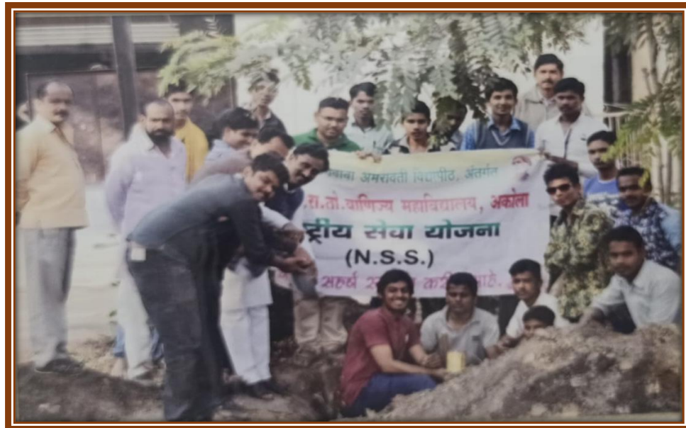
Constructing Soak Pits for Water Conservation under Waste Water Management in NSS Special Camp at Adopted Village Kumbhari