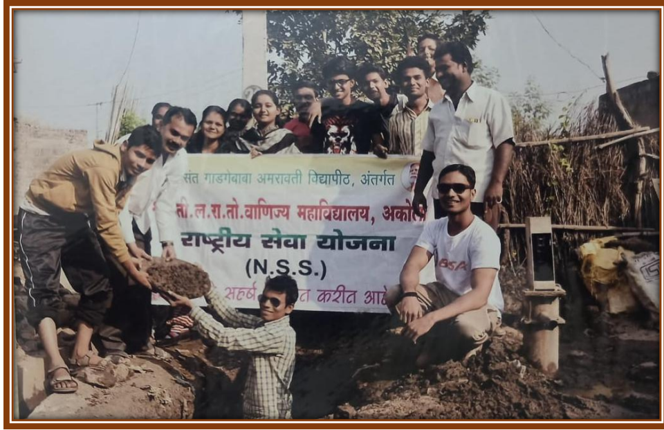
NSS Volunteers Constructing Soak Pits for Water Conservation near Hand Pumps At Adopted Village Kumbhari