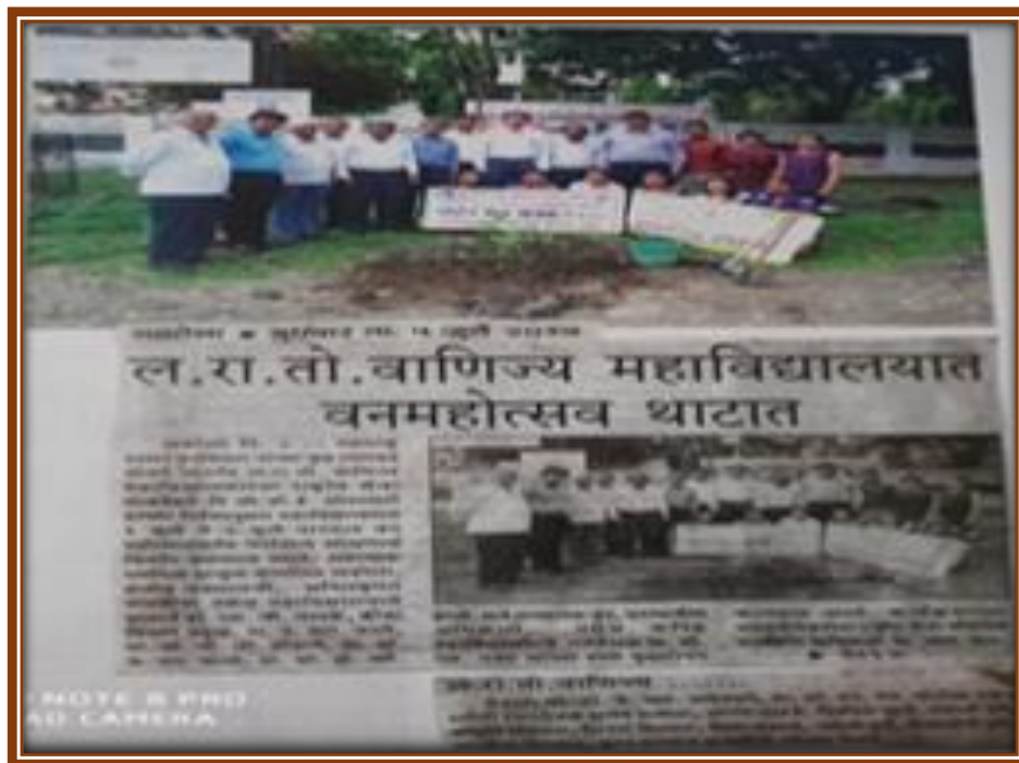
Tree Plantation by NSS Volunteers under 'VANMAHOTSAV - 2017'