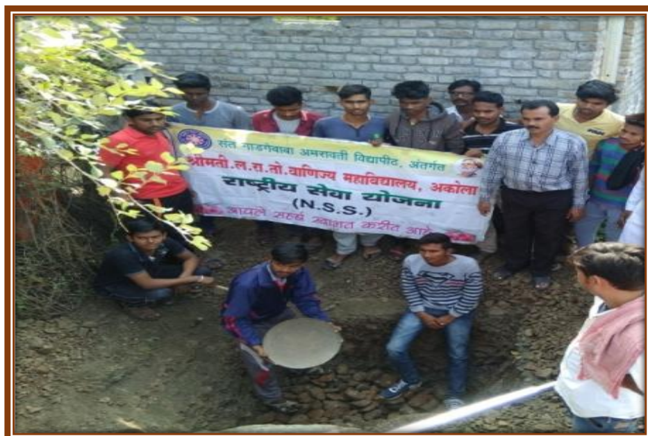
Construction of Soak Pits under Special Project of Waste Water Management at Adopted Village Khirpuri