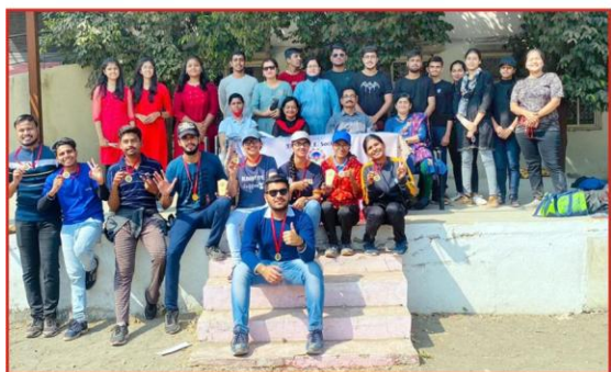
C.O.C Department Educational Tour