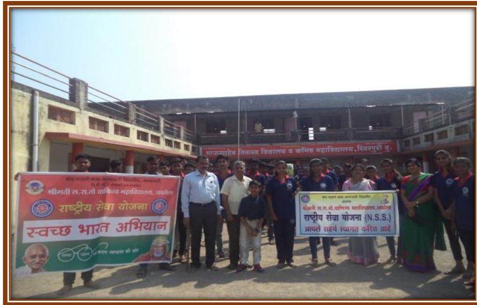
SWACCHA BHARAT ABHIYAN Awareness Rally at Adopted Village Khirpuri