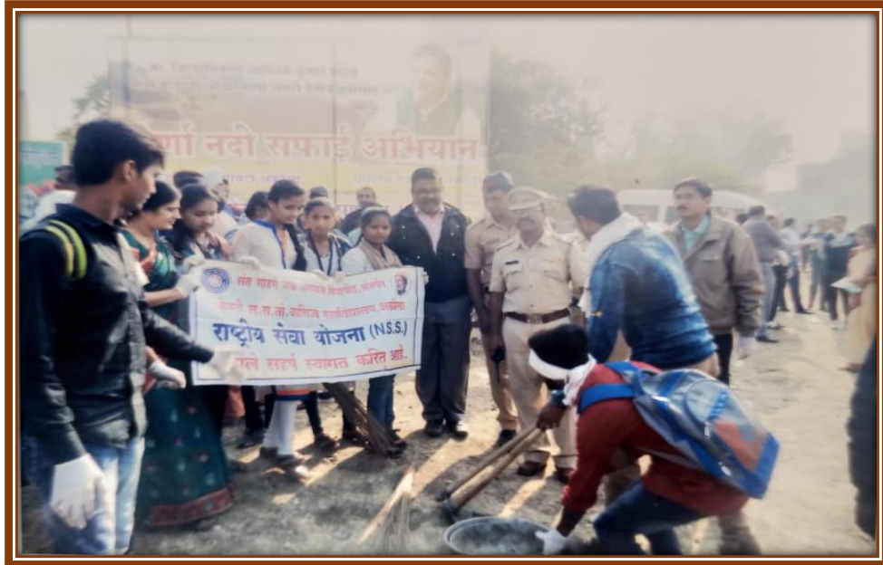
NSS Volunteers participated in 'MORNA NADI SAFAI ABHIYAN' AKOLA