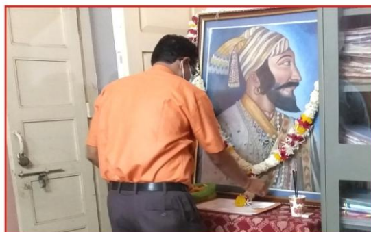
Shivaji maharaj jayanti celebrated on 19 th Feb 2021