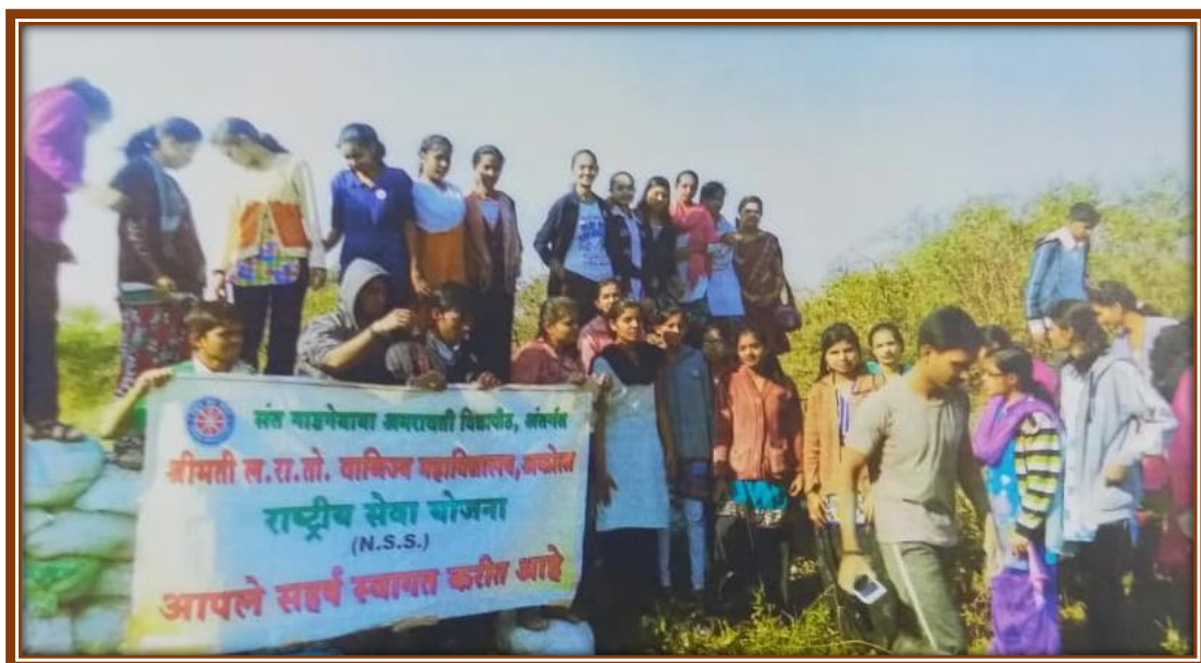
NSS Volunteers constructed WANRAI BANDHARA at Adopted Village Kumbhari