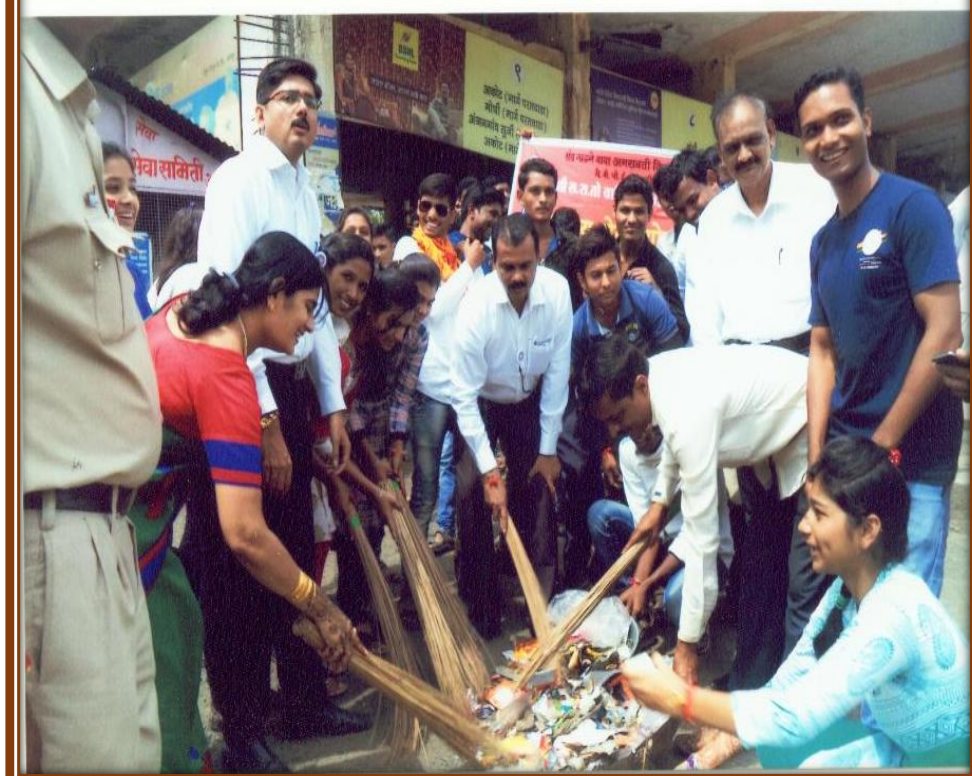
NSS Unit Conducting Cleanliness Drive at AKOLA BUS STATION