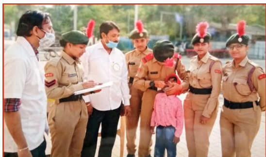
Participation of NCC Cadets of Smt. LRT College of Commerce Akola, in the Pulse Polio Campaign (31 January) in the presence of Doctors.