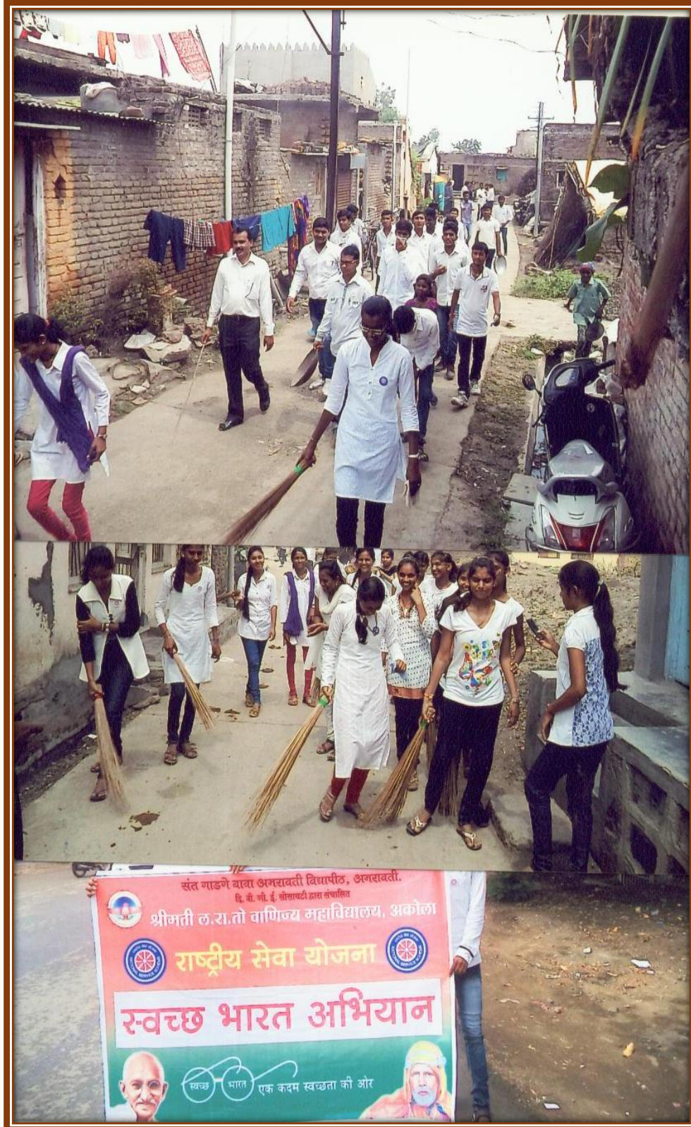
SWACCHA BHARAT ABHIYAN at Adopted Village Kumbhari